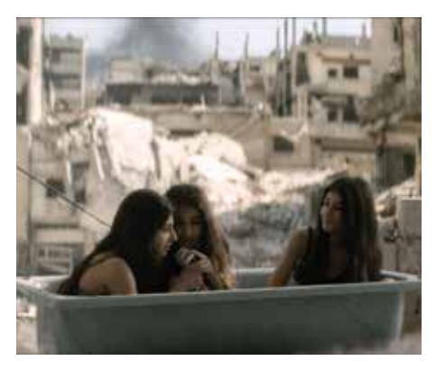
Film still: Gold (p.37)

Come early and enjoy a cup of tea on arrival.