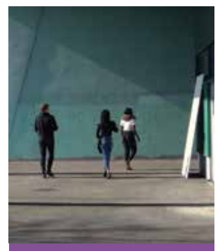
SAT 15 SEPT | 12:30 GFT, Glasgow £10.50/7.50 concs. £5.50 Under 25 (with GFT 15-25 card) Book via GFT

Original title: Premières solitudes Claire Simon France, 2018, 100 min French with English subtitles Ages 8+