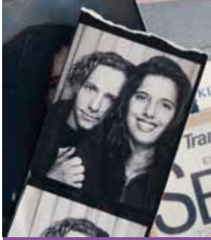
MON 17 SEPT | 20:30 Filmhouse, Edinburgh £10/8 concs. £5.50 Under 25 (with valid ID) Book via Filmhouse

Recording their conversations as they visit a domestic-violence counsellor, as well as their high school and the apartment they shared, A Better Man tackles the issue of genderbased violence from a rarely seen angle. Despite its title, it resists catharsis or resolution to offer an intimate, raw and empowering reflection on how abuse continues to linger through both the survivor and the perpetrator's lives, while Attiya seeks a different path towards healing and justice.