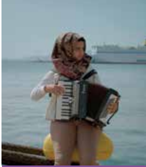
SAT 15 SEPT | 20:30 Filmhouse, Edinburgh £10/8 concs. £5.50 Under 25 (with valid ID) Book via Filmhouse

Taylor elicits fascinating and often funny responses from her contributors in this welcome invitation to ask questions and to think, together, of the role we can all play in bringing about a more equitable political system.