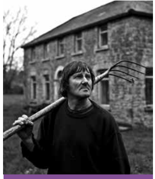
TUES 18 SEPT | 20:30 Filmhouse, Edinburgh £10/8 concs. £5.50 Under 25 (with valid ID) Book via Filmhouse

Feargal Ward Ireland, 2017, 77 min English Ages 12+