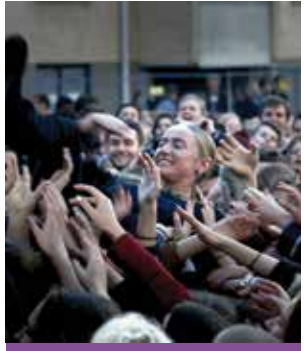
FRI 14 SEPT | 20:30 Filmhouse, Edinburgh £10/8 concs. £5.50 Under 25 (with valid ID) Book via Filmhouse

TUES 18 SEPT | 19:00 CCA, Glasgow £6.50/5.50 concs. Book via takeoneaction.org. uk/events